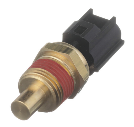
NAPA® Echlin® TS6740 Ford/Mazda (2011-96)